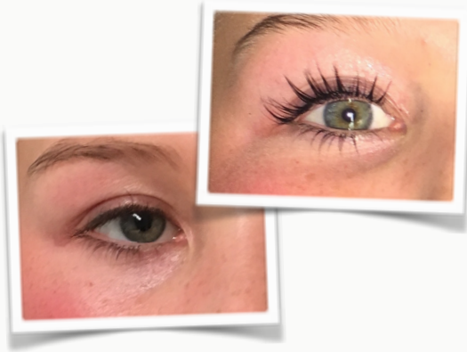
Before Keratin Lash Lift (Lower Left), After (Upper Right)

Tori Dee is home of the Keratin Lash Lift in Mobile, AL. Here we use the revolutionary brand YUMI™ LASHES to give you that night on the town look, without all the work! YUMI™ LASHES was founded by Swiss Derma-Pigmentologist and permanent makeup expert artist, as a luxurious alternative to eyelash extensions, fake eyelashes, false lashes and growth serums. This is a treatment to lift and boost your natural lashes. our treatment turns the eyelashes upwards, giving them length, height and volume. This results in an appearance of having longer and thicker lashes. The YUMI™ Lashes effect lasts between 8 and 12 weeks, which is the natural life cycle of an eyelash. Our product is the very definition of elegance and high-end keratin lash treatments in the industry today.